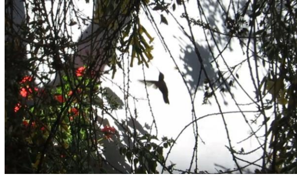
Sometimes the hummingbird converts itself into its own shadow