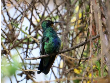
When still on a branch, it is easier to take a photograph of the hummingbird